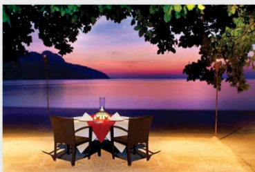
The Andaman Resort 5-Star luxury only 1.7km from Els Club Teluk Datai

The package prices advertised on the Golf Tours Abroad website are based on a range of 3-5 Star hotel accommodation in various locations on Langkawi. Hotels are subject to availability so if you'd like to enquire about single-share accommodation, additional nights, other particular hotels, additional golf or any other variations to the package, please contact Golf Tours Abroad directly. We specialise in tailoring to our customers' needs, so if you'd like to vary any part of our packages, please don't hesitate to ask.